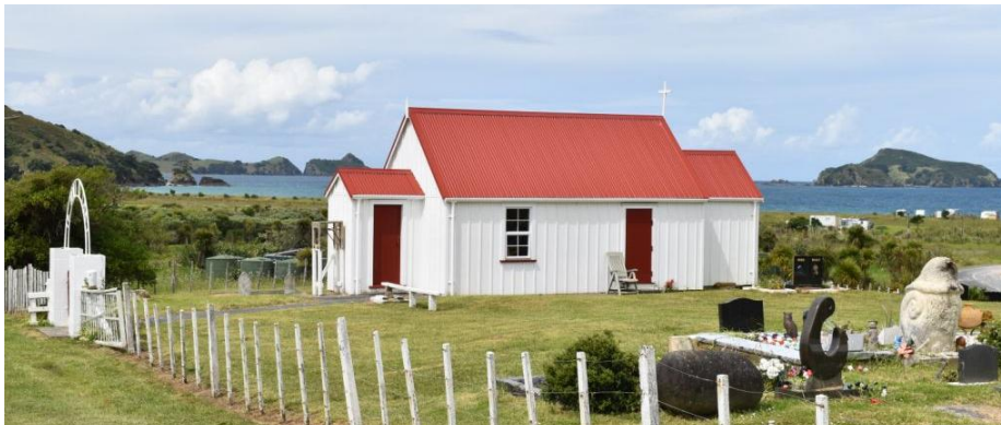
Samuel Marsden Memorial Church in Matauri Bay

The new floor acknowledges the historic relationships between people and native timber in Northland.