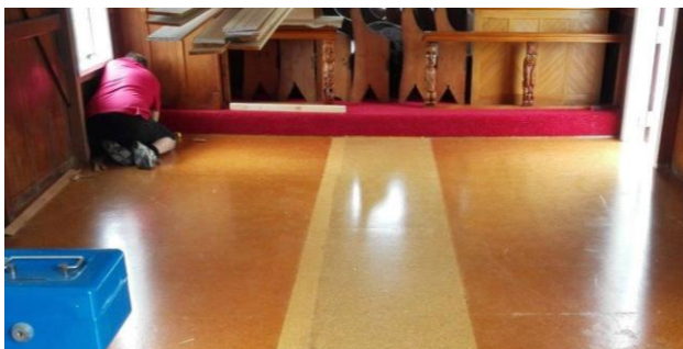
Particleboard floor that was replaced